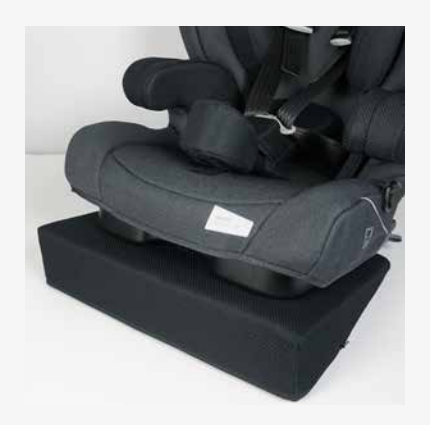
The seat wedge inside and below provide a relaxed resting position during the journey.