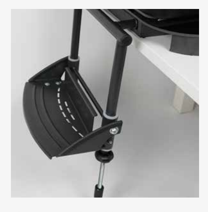
The practical padded swivel base, the Seatfix connection for ISOFIX and the footrest give additional stability.