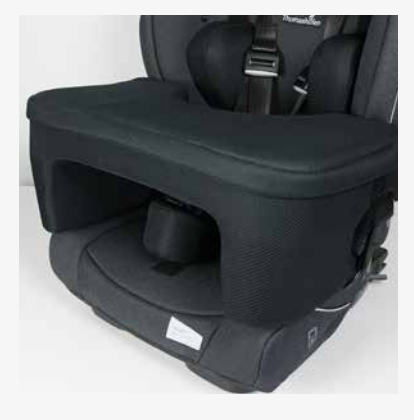
The table is a support surface and an additional impact shield that also prevents the child from attempting to unbuckle the 5-point positioning harness.