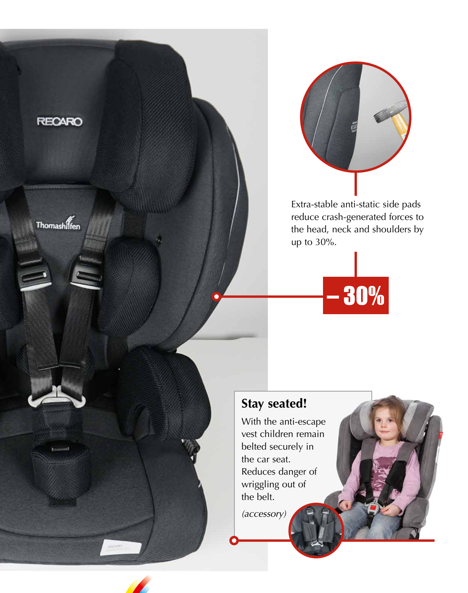
Thomashilfen Finely designed to make life easier